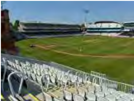
New Allen Stand view

It was good to walk round the three levels of the rebuilt Allen Stand during the Middlesex v Surrey T20 match on 24th May. The structure is still a shell with completion expected in Spring 2027. The seats are there - comfortable and with good spacing. I particularly liked the view from the first floor. The roof is not in place, nor a walkway to connect the top floor of the stand to the top floor of the Pavilion.