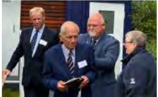
Clive Radley Cap Presentation