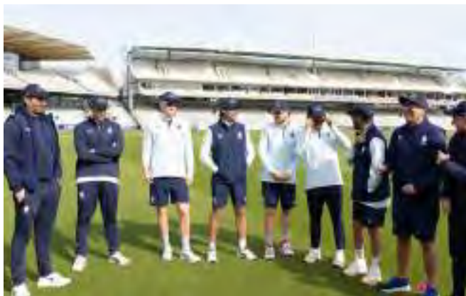
Players and Coaches