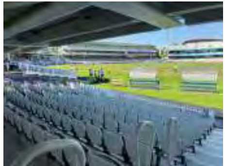
New Allen Stand seating

Many Seaxe Members will have very happy memories of the old stand and the Middlesex Room there. Let's hope the new Middlesex Room in the Allen Stand lives up to expectations when we can use it next year.